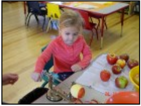
Peeling Apples & Making Applesauce