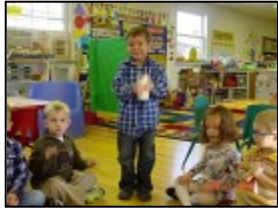
Shaking & Making Butter Great Exercise!

Once again, the Shepherd of My Heart preschoolers make a yummy Thanksgiving snack for their parents. Warm homemade applesauce, bread with real homemade butter, and crunchy popcorn topped the menu. It was a fun and educational morning steeped with thankfulness for all that God provides!